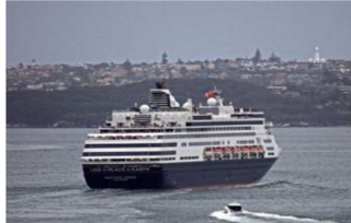
VASCO DA GAMA

IMO: 8919245, Built: 1993, Fincantieri LOA: 219.4 / Beam: 30.8 / Draft: 7.77, Class: LR, Flag: Bahamas GT: 55,877 / Passengers: 1636 / Cabins: 630 / Decks: 13 (10 pax) Engines: 2 x Sulzer 12ZAV405, 3 x Sulzer 8ZA405 - Total 44,438.8 BHP The Vessel is at the Port of Tilbury where inspectable by arrangement.